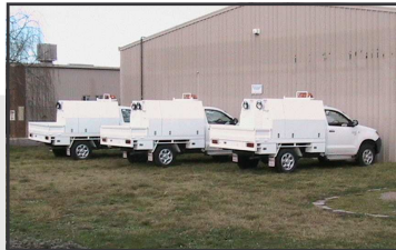
Multiple identical units