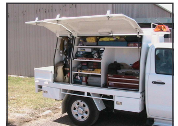
A place for everything